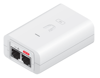
POE-48-24W-WH POE-24-24W-G-WH POE-48-24W-G-WH