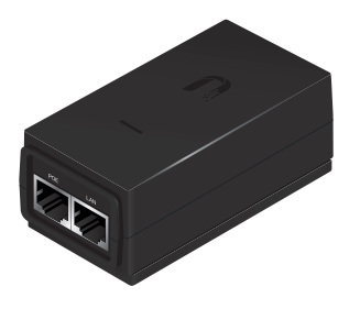
POE-15-12W POE-24-12W POE-24-12W-G